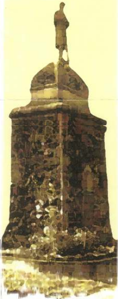
ORIGINAL MONUMENT AT DADE BATTLEFIELD